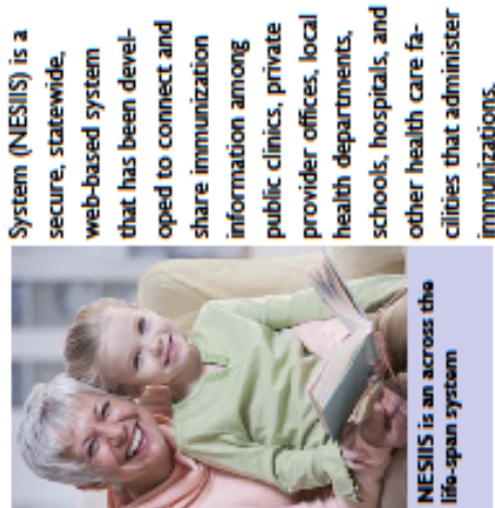
NESIIS is an across the life-span system

The Nebraska State Immunization Information