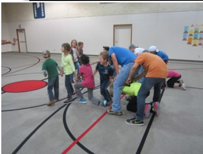
During P.E. classes, children enjoy a team-building exercise.